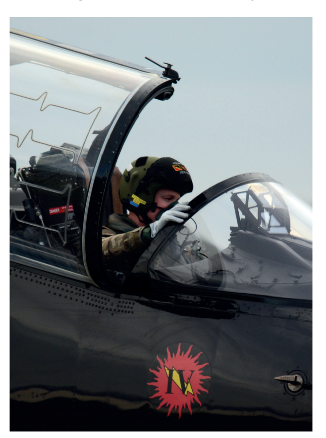
Figure 4: An aircraft canopy

14. The aircraft canopy of the fighter jet in Figure 4 allows the pilot to see out while flying. It is made from a thick polycarbonate which can absorb the impact of any debris.