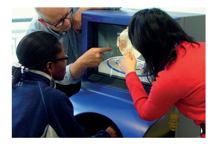
Figure 3: People interacting with an exhibit in a museum