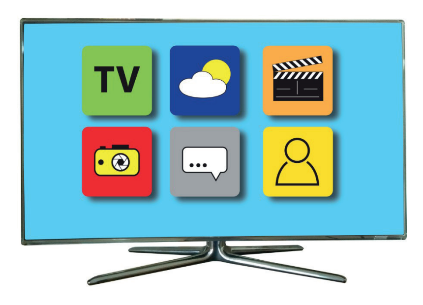
Figure 2: An internet-ready television

What is an internet-ready television an example of?