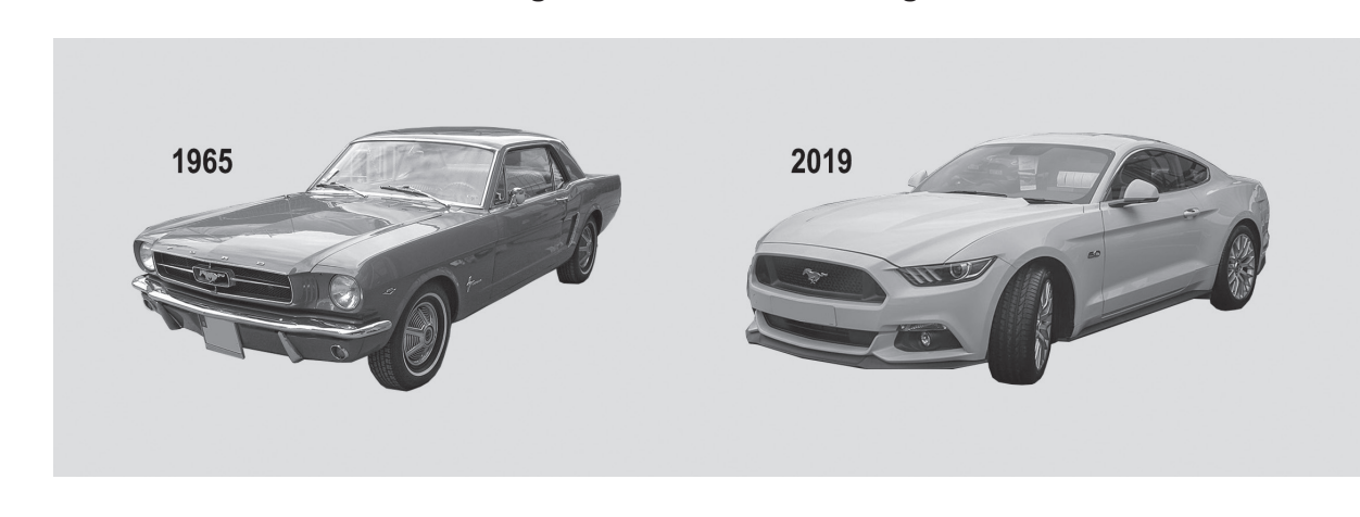
Figure 6: The Ford Mustang

24. Figure 6 shows the Ford Mustang, which was first manufactured in 1965 is still being manufactured in 2019. The engineers of the new car have designed the sound of the engine to replicate the original model.