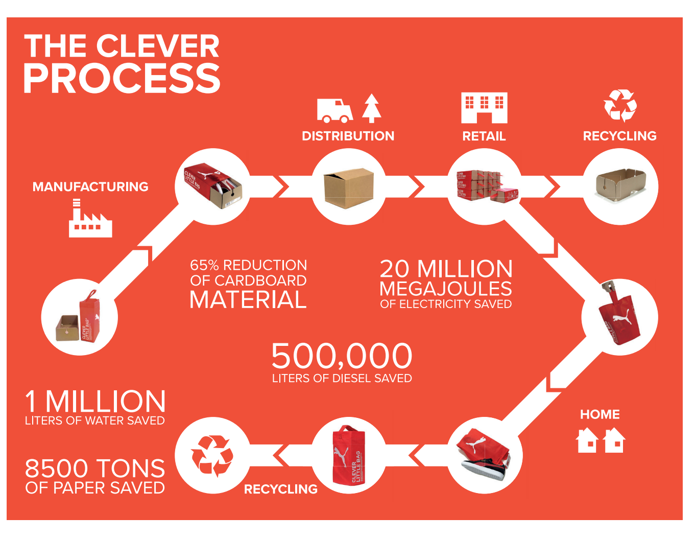
Figure 8: A graphic illustrating the manufacturing process of Clever Little Bags