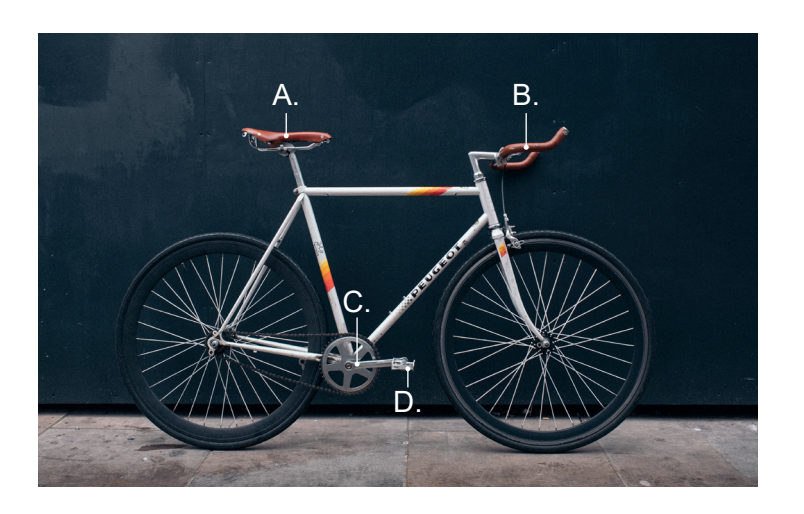
Figure 1: A bicycle

1. A labelled image of a bicycle is shown in Figure 1 .